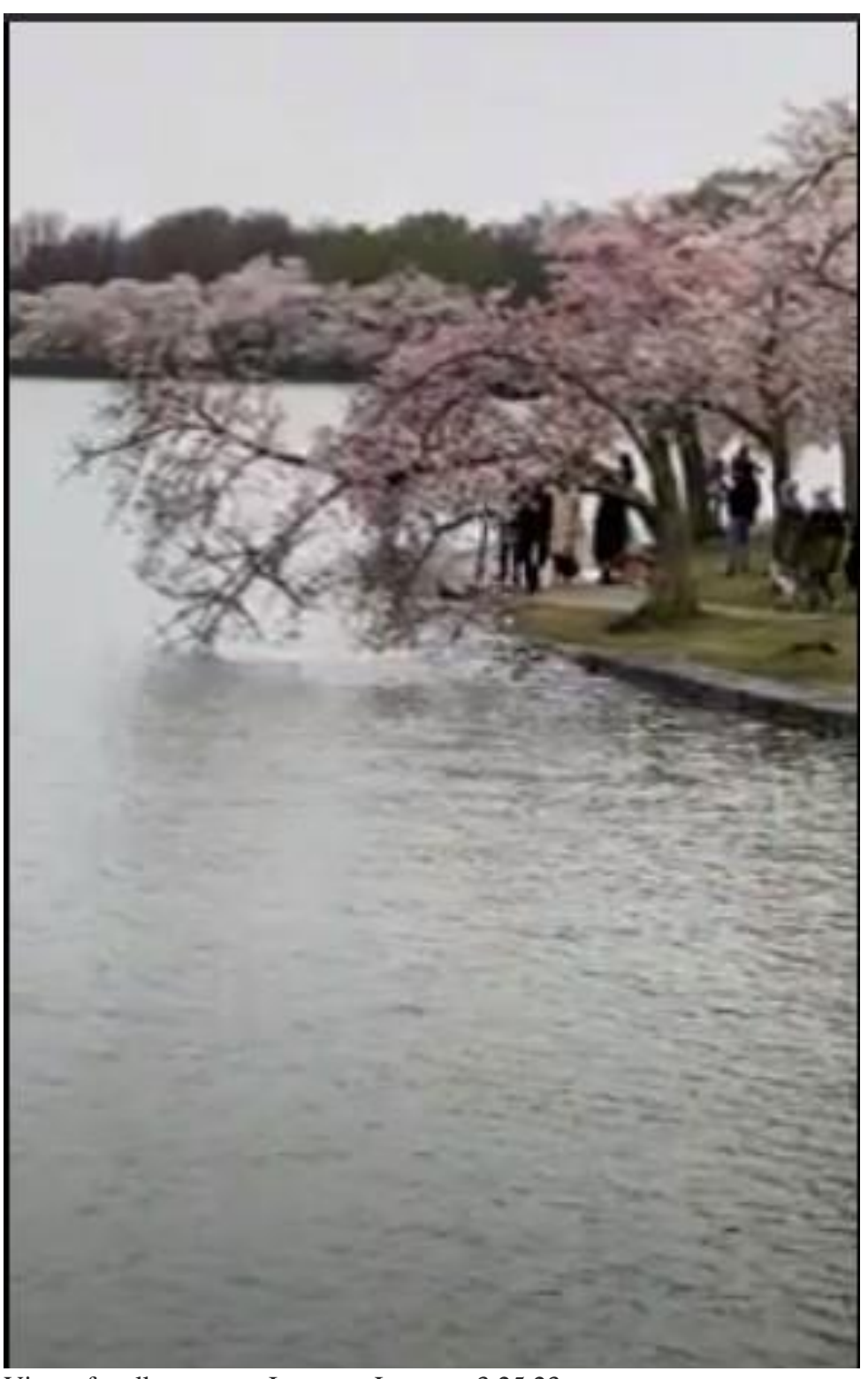
View of walkway near Japanese Lantern. 3.25.23