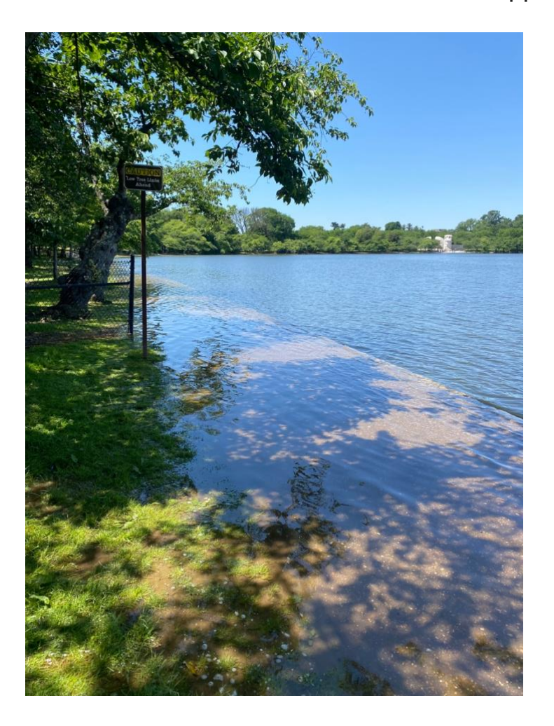
Link to video showing flooding near room 2/3 of the FDR Memorial Seawall: <a href="https://drive.google.com/file/d/15kOliHosj8hLAzZQwubtdc0jDIZEjlwJ/view?usp=sharing">https://drive.google.com/file/d/15kOliHosj8hLAzZQwubtdc0jDIZEjlwJ/view?usp=sharing</a>

At end of FDR memorial 5/25/2023 overtopping seawall and walkway.