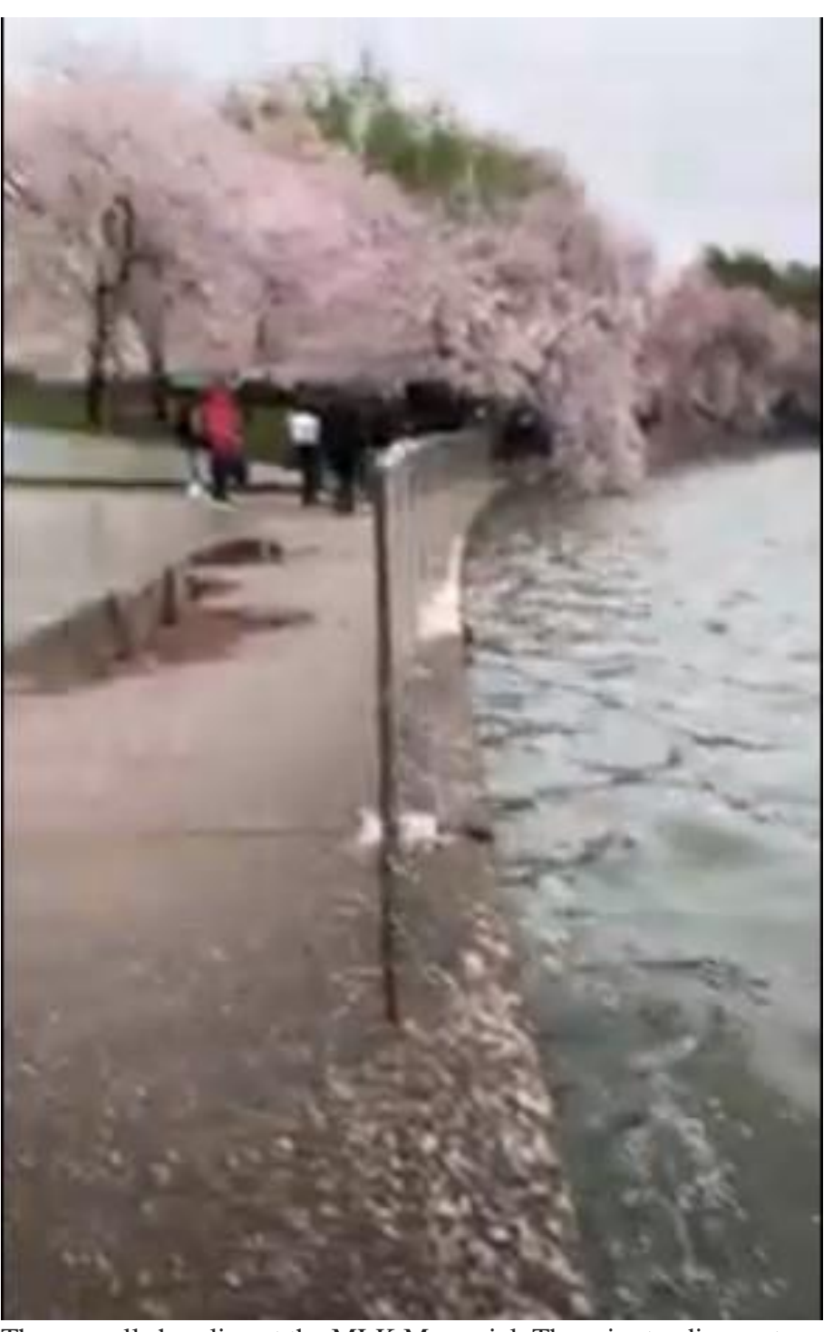
The seawall shoreline at the MLK Memorial. There is standing water and water nearing the top of the seawall. 3.25.23