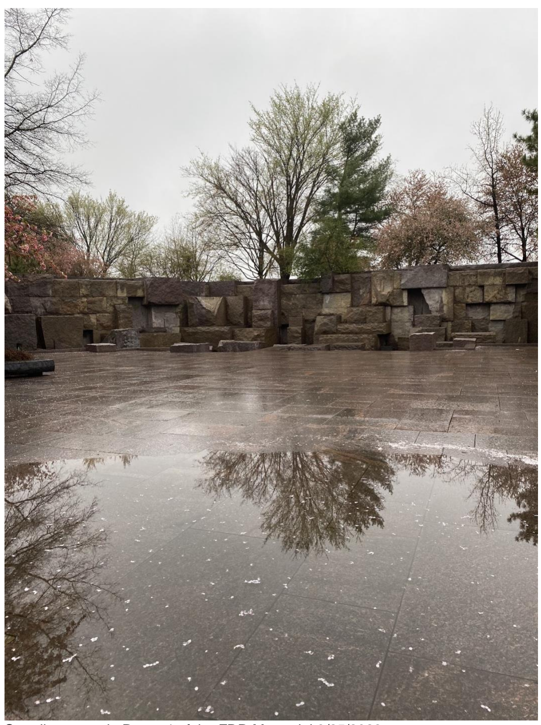
Standing water in Room 4 of the FDR Memorial 3/25/2023