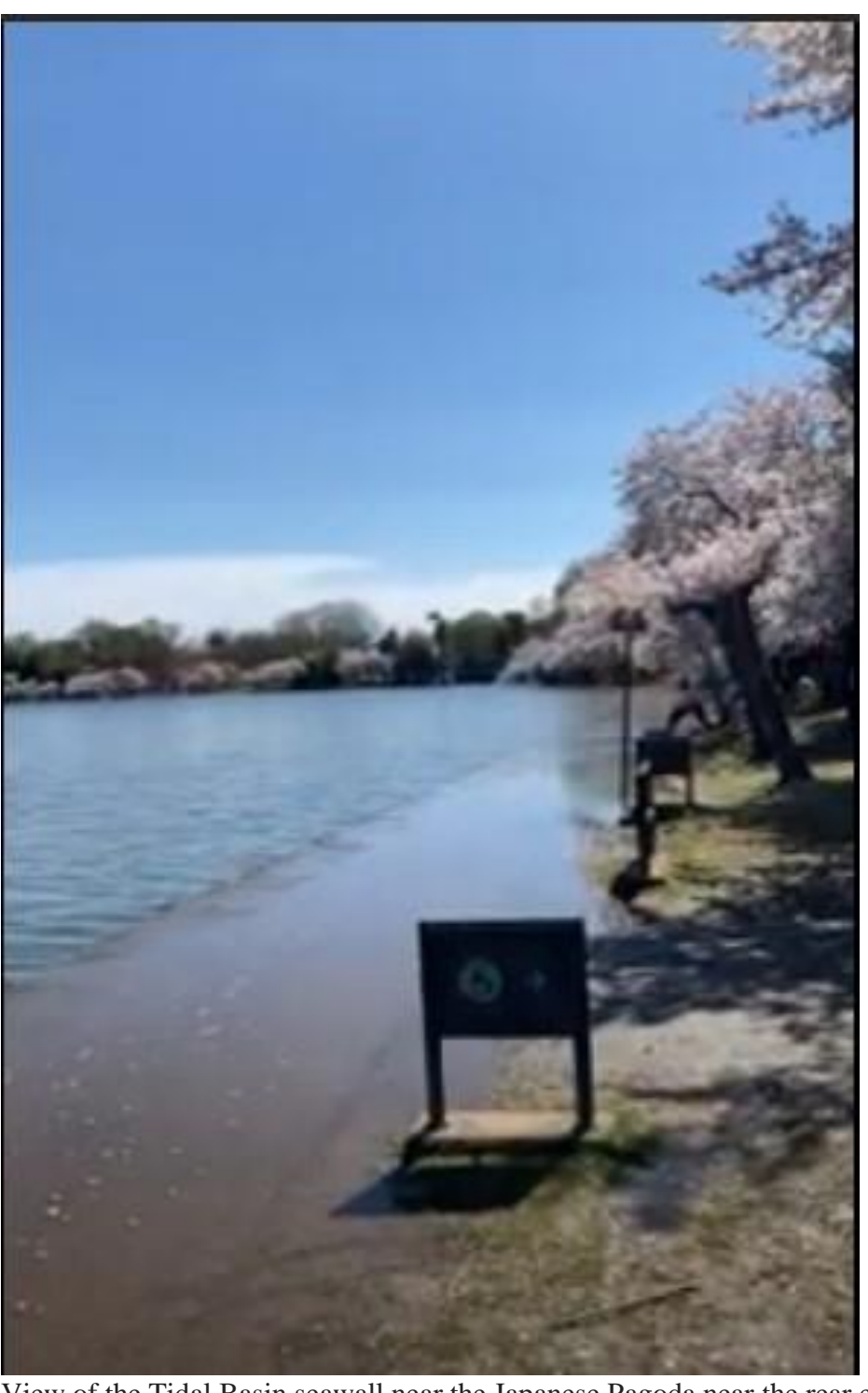
View of the Tidal Basin seawall near the Japanese Pagoda near the rear entrance to the FDR Memorial. 3.25.23